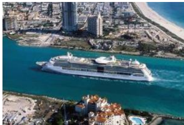
Grand Prize Raffle: 4-5 Day Cruise for two on Royal Caribbean International