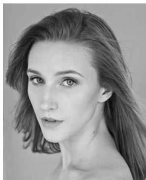
Devon Teuscher Soloist, American Ballet Theatre