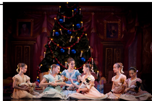
BBT Dancers in The Nutcracker