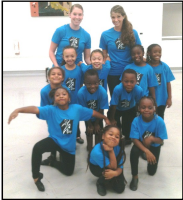
1st Step Outreach Program 2012

to overcome this obstacle and expand the program beyond the Boca Raton Housing Authority. As a result of the growing success of 1 st Step, Boca Ballet Theatre is eager to help students take the "Next Step" by providing a year-long scholarship to 3-5 students who show promise throughout the 1 st Step Program.